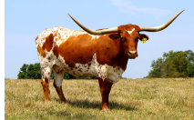
PERMANENT REBEL 12/6