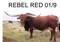
REBEL RED 01/9