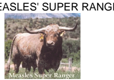
MEASLES' SUPER RANGER