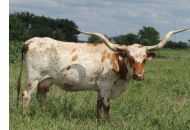
PERMANENT BELIVER 58/2