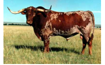
SHE'S A SUPER LADY